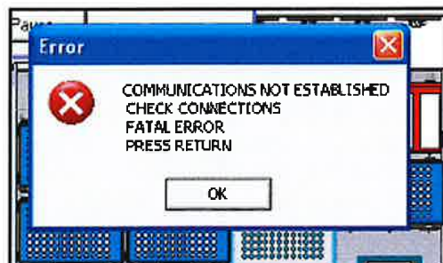
Figure 6. Example of error

press OK and the program will be aborted automatically. Check that all the connections to the instrument (shaker, heater and computer) are properly plugged in. If everything is OK, you need to close WinPrep, shut down the instrument, shaker, heater and PC. After 2 min restart everything. Once Winprep has been opened, reinitialise the instrument and start the program (check version number according to which step the message has come up). Please read troubleshooting 5 for barcode reading of plates.